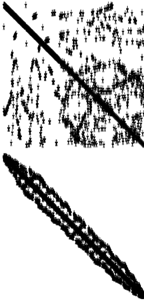
Figure 2 Sparsity of the matrix before (top) and after (bottom) the renumbering